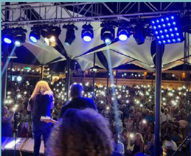
Photos taken at Teos Marina after the pandemic.

During the pandemic, the marina industry, which is one of the arteries of marine tourism, has also gone through some changes. It is a fact that, with the transformation of Covid-19 into a pandemic, people began to worry more about financial, social, security and most importantly health than in the past, and to find the lifestyle they had in the past risky. Mobility restrictions, physical distancing and hygiene measures have made the consumer more selective in all their choices. In big cities, people started to do their grocery shopping via internet platforms, and they preferred to go to boutique hotels, hostels or rent a house during the holidays. Again, in this process, the demand for the "idea of owning a boat" increased tremendously.